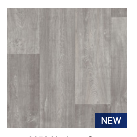
2258 Hudson Grey