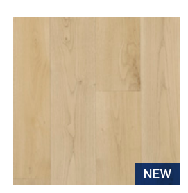
2265 Savannah Clear Repeat: 1000mm x 1000mm