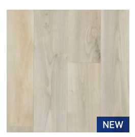
2263 Savannah Sand