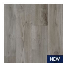
2264 Savannah Medium