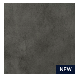
2261 Shade Dark Grey