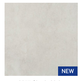
2257 Shade Light