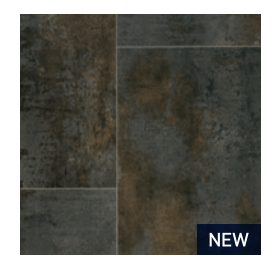
0836 Verone Grey