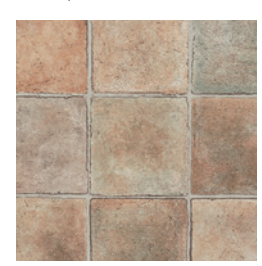
0447 Cassiopee Grass