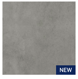
2259 Shade Medium Grey