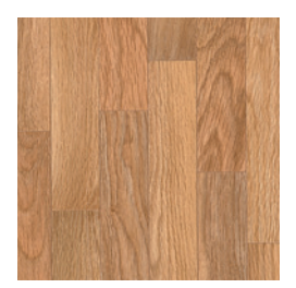
0405 Chene Medium