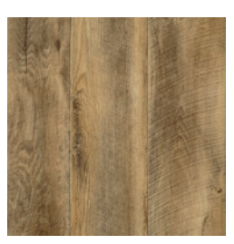
1104 Cajou Nut