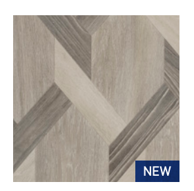
2256 Opera Medium