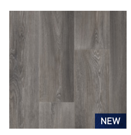
2266 Empire Grey