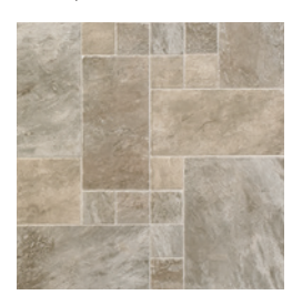
0873 Offset Beige