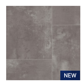
1284 Verone Light Grey