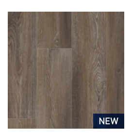
2260 Empire Dark Brown Repeat: 1333mm x 1000mm