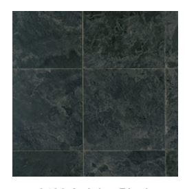
0496 Ardoise Black