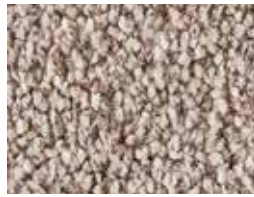
▲ SMB: LSRU.0253 | 400 & 500 cm