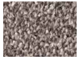
▲ SMB: LSRU.0830 | 400 & 500 cm