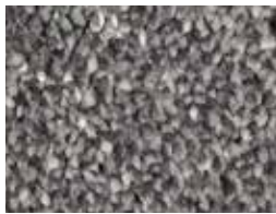
▲ SMB: LSRU.0850 | 400 & 500 cm