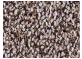
▲ SMB: LSRU.0273 | 400 & 500 cm