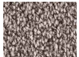
▲ SMB: LSRU.0263 | 400 & 500 cm