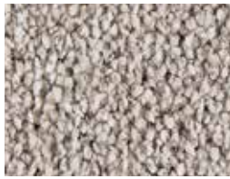
▲ SMB: LSRU.0433 | 400 & 500 cm