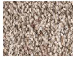
▲ SMB: LSRU.0233 | 400 & 500 cm