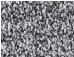
▲ SMB: LSRU.0843 | 400 & 500 cm