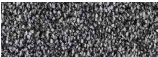
▲ SMB: LSRU.0823 | 400 & 500 cm