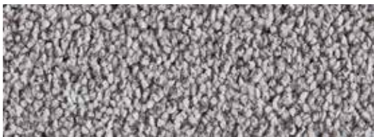
▲ SMB: LSRU.0423 | 400 & 500 cm